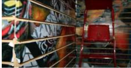
< Wood surface Failure >