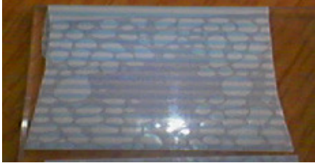
< Bubble from Polycarbonate >

This cause Edge lifting & Adhesion Failure.