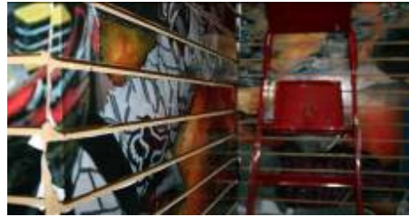
< Wood surface Failure >