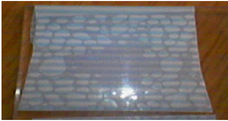
< Bubble from Polycarbonate >