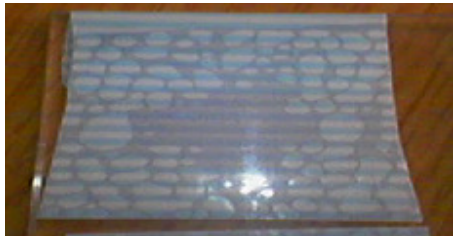
< Bubble from Polycarbonate >