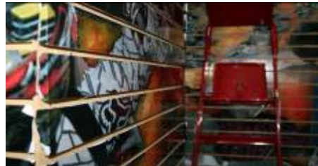
< Wood surface Failure >